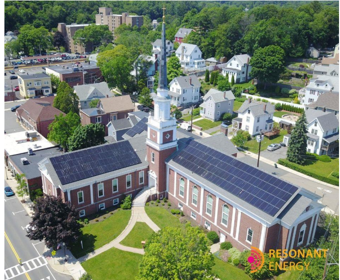
A solar PV system installed at the Melrose Highlands Church.

Many Federal and State incentives exist to support the installation of solar PV and other renewable energy. For information about what incentives are available for renewable energy systems Database of State Incentives for Renewables and Efficiency for information about what incentives are available for renewable energy systems.