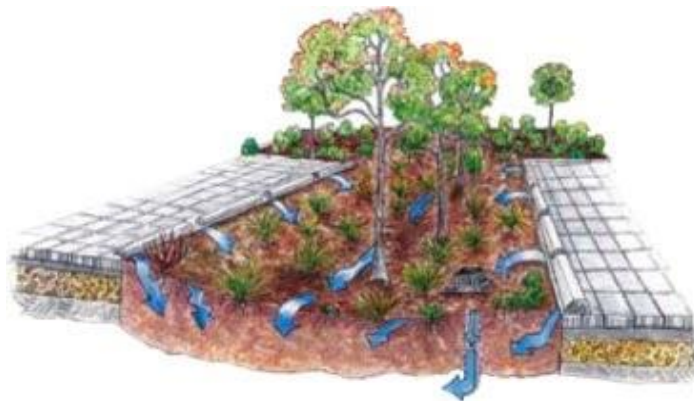
Diagram from Center for Urban Waters

Rain gardens and bioswales utilize natural elements like rocks, mulch, and plants to capture stormwater, slow it down, filter it, and absorb it into the ground rather than the stormwater systems.